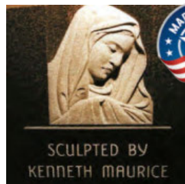
SCULPTED BY KEPPETH MAURICE