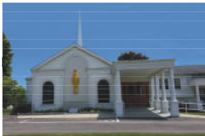
Our Lady of Grace Church Located at 715 Bantam Road, P.O. Box 427, Bantam, CT 06750 860-567-9522 ourladyofgrace@optonline.net