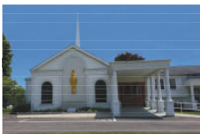
Our Lady of Grace Church Located at 715 Bantam Road, P.O. Box 427, Bantam, CT 06750 860-567-9522 ourladyofgrace@optonline.net