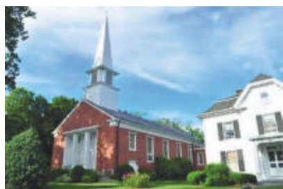
St. Anthony of Padua Church Located at 49 South Street, P.O. Box 97, Litchfield, CT 06759 860-567-5209 stanthonypadua@optonline.net

If You Touch Me, Take Me. Please Come Back To Church, It is Safe!