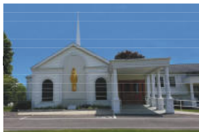
Our Lady of Grace Church Located at 715 Bantam Road, P.O. Box 427, Bantam, CT 06750 860-567-9522 ourladyofgrace@optonline.net