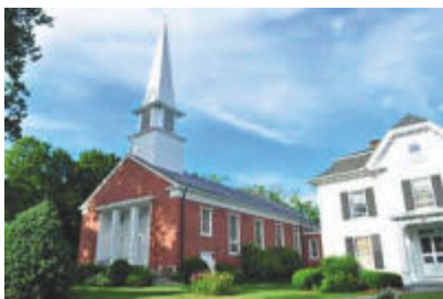
St. Anthony of Padua Church Located at 49 South Street, P.O. Box 97, Litchfield, CT 06759 860-567-5209 stanthonypadua@optonline.net

If You Touch Me, Take Me. Please Come Back To Church, It is Safe!