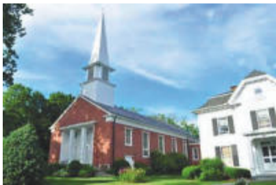
St. Anthony of Padua Church Located at 49 South Street, P.O. Box 97, Litchfield, CT 06759 860-567-5209 stanthonypadua@optonline.net

If You Touch Me, Take Me. Please Come Back To Church, It is Safe!