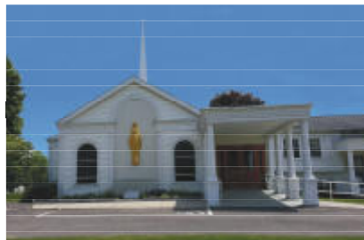
Our Lady of Grace Church Located at 715 Bantam Road, P.O. Box 427, Bantam, CT 06750 860-567-9522 ourladyofgrace@optonline.net