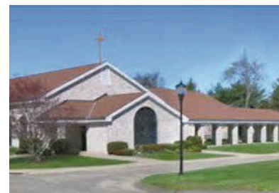
St. Thomas of Villanova Church Located at 71 North Street, P.O. Box 177, Goshen, CT 06756 860-491-2756 stthomaschurch@optonline.net