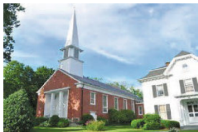
St. Anthony of Padua Church Located at 49 South Street, P.O. Box 97, Litchfield, CT 06759 860-567-5209 stanthonypadua@optonline.net