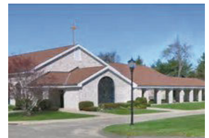
St. Thomas of Villanova Church Located at 71 North Street, P.O. Box 177, Goshen, CT 06756 860-491-2756 stthomaschurch@optonline.net