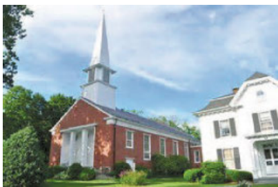
St. Anthony of Padua Church Located at 49 South Street, P.O. Box 97, Litchfield, CT 06759 860-567-5209 stanthonypadua@optonline.net