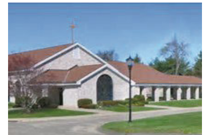
St. Thomas of Villanova Church Located at 71 North Street, P.O. Box 177, Goshen, CT 06756 860-491-2756 stthomaschurch@optonline.net