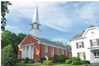
St. Anthony of Padua Church Located at 49 South Street, P.O. Box 97, Litchfield, CT 06759 860-567-5209 stanthonypadua@optonline.net