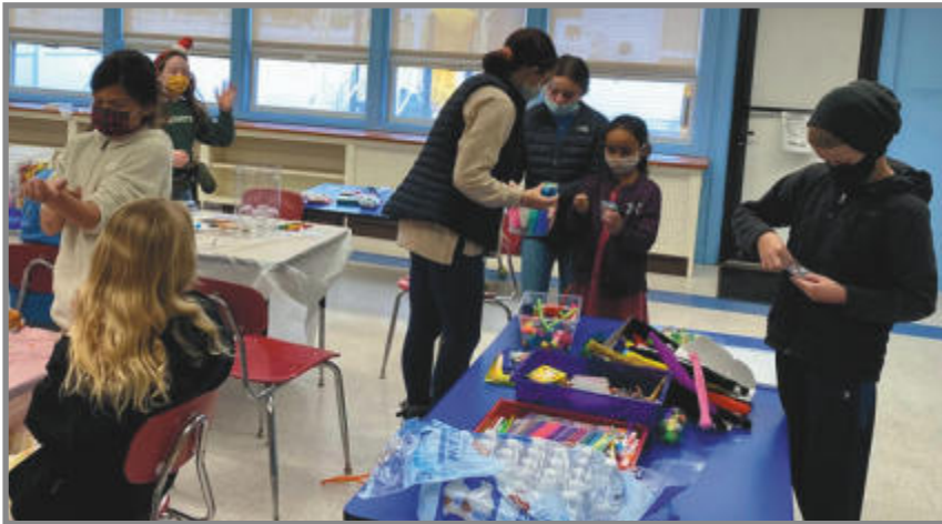
Above: Crafters at work.

On December 12, the Religious Education students helped to decorate the Parish Center and participated in Crafts & Trivia, followed by hot chocolate and cookies. A good time was had by all 😊.