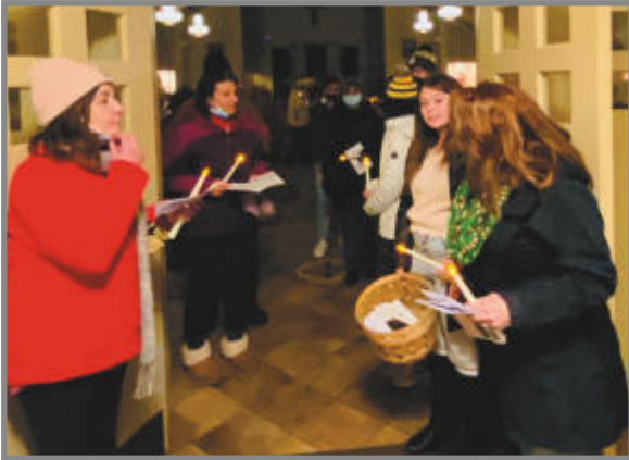
Above, left: Leaving the church to go to the blessing of the Manger.