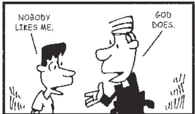
2ND SUNDAY IN ORDINARY TIME

While the shop is closed, please do not leave any donations on the porch or at the door to the Thrift Shop. Thank you for understanding.