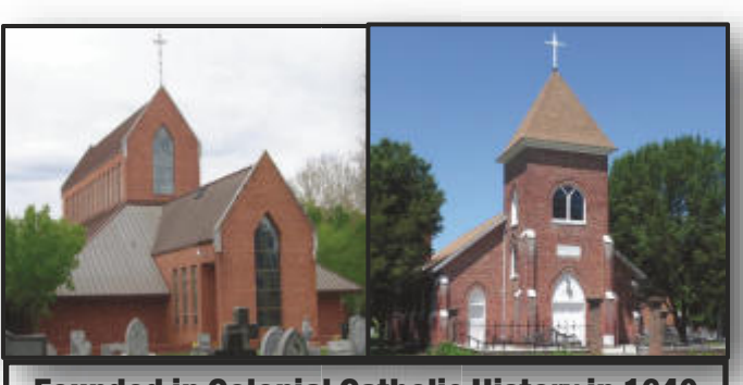
Founded in Colonial Catholic History in 1640 Canonically Established in 1830

Saturday \sim 2:30 to 3:45 p.m. in the Main Church (Jan 1st) Sunday~ before 9:30 & 12:00 Masses or by appointment