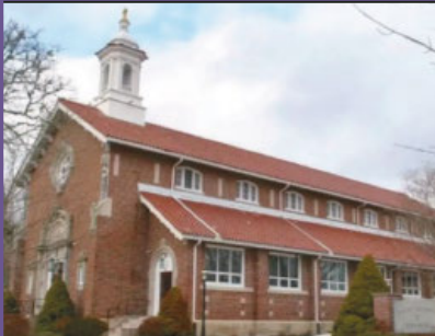
ST. GEORGE CHURCH 12 Highland Avenue