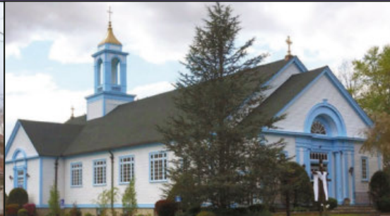
OUR LADY OF GRACE CHURCH 569 Sanford Road