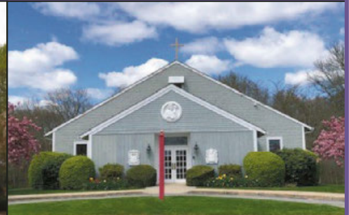
ST. JOHN THE BAPTIST CHURCH 945 Main Road