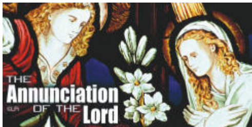
The Annunciation of the Lord Thursday, March 25, 2021