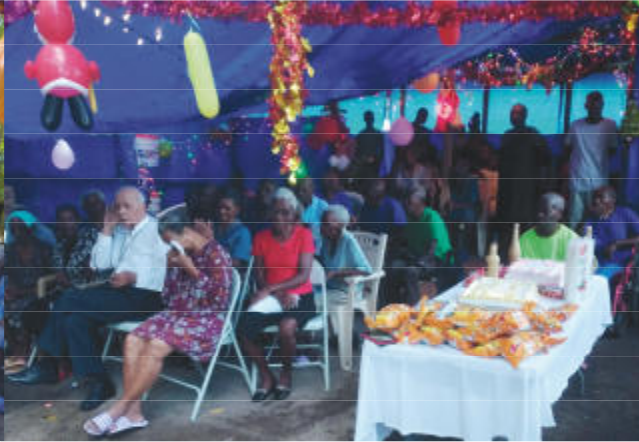
Christmas parties in Haiti. Top left, Teach the Children; plus pictures of Mass and party for Foyer (nursing home) residents at their interim tent home.