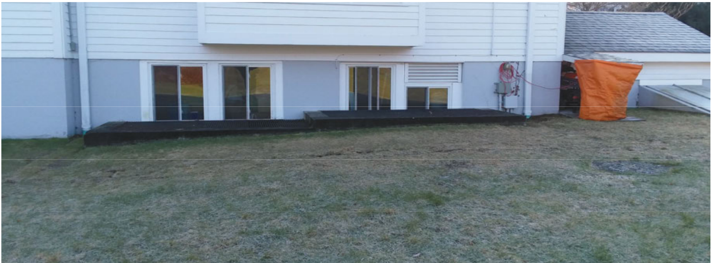
Above: Rear of church; both roof drains put into new underground pipes; larger capacity

two roof downspouts put into underground pipe; parking lot side, downspout into underground pipe