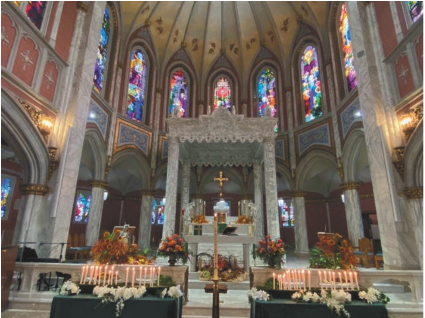
Annual Mass of Remembrance—St. Mary's Church November 15, 2020