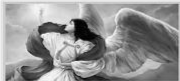
St Gabriella Girls for God Ministry Ages 10-18 years old

Have CDs or DVDs you are no longer using? If they are entertaining or instructional and suitable for our Parish library, they can be dropped off at the office. Your donations will be appreciated.