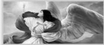
St Gabriella Girls for God Ministry Ages 10-18 years old