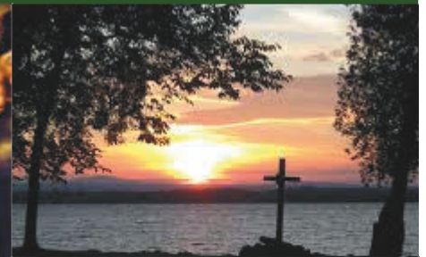
The Feast of Sts. Joachim & Anne Sunday, July 26, 2020