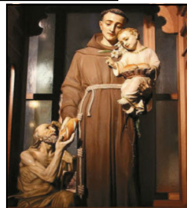
Through the Intercession of St. Anthony

WE ENDEAVOR TO SHARE OUR TIME, TALENT AND TREASURE TO PROCLAIM THE GOSPEL OF JESUS CHRIST, AND AS HIS CHURCH, TO GROW IN FAITH AND LOVE, TO ACT IN CHARITY AND TO SERVE ALL OF HIS PEOPLE.