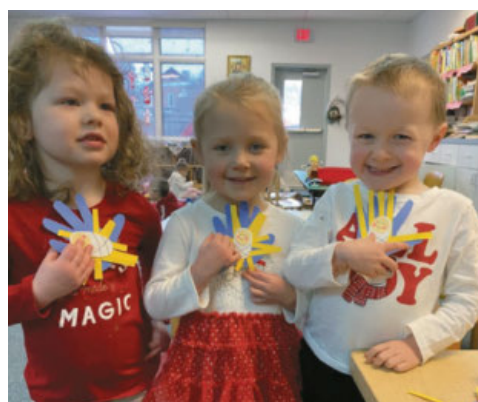
Norton nursery class:

We made baby Jesus crafts to celebrate the upcoming Christmas holiday! We have been learning all about the Holy Family and singing Christmas songs together. We love celebrating Advent at school with our friends!