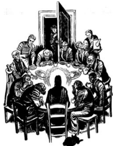
THE LORD'S SUPPER (1953)

In Fritz Eichenberg's famous wood engraving of "The Last Supper," a typical soup kitchen crowd gathers at a dining room table. All have a place of equality and dignity. And every head is turned to Christ. Pope Francis is asking us to dream a Church which looks like that.