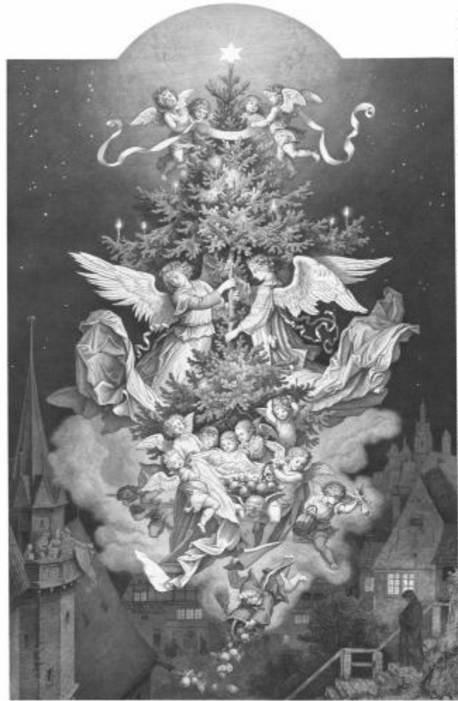
Shown is the wood engraving "The Christstracht" by Ludwig Richter, 1854.

“Our Saviour, dearly-beloved, was born today: let us be glad. For there is no proper place for sadness, when we keep the birthday of the Life, which destroys the fear of mortality and