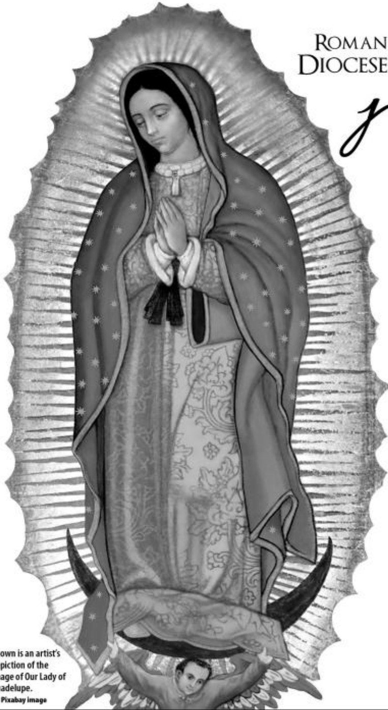
Shown is an artist's depiction of the image of Our Lady of Guadalupe.