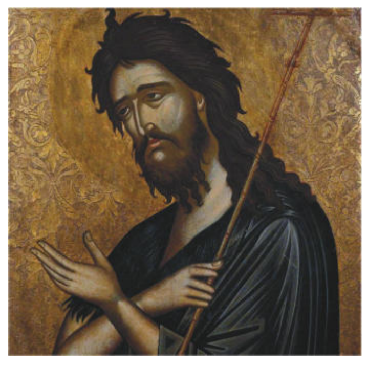
Every valley shall be filled and every mountain and hill shall be brought low