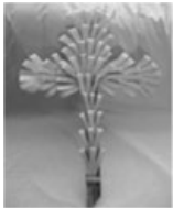
Palm Cross $12.00