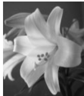
Easter Lily $15.00

April 2 ~ after 5pm Mass AND April 3 ~ 7:30 am to 1:30 pm & after 6 pm Mass