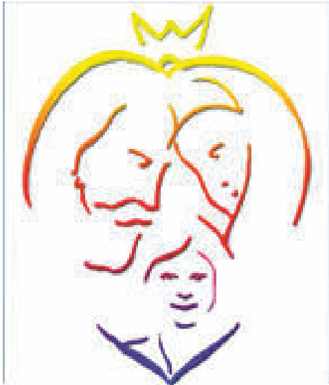
Holy Family Parish