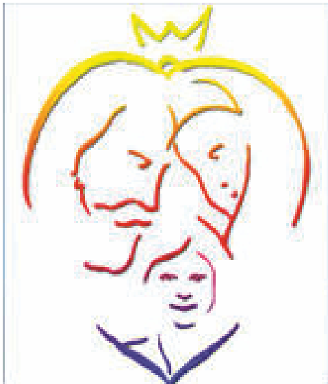
Holy Family Parish

Weekday: 7:00am M-F (St. Ladislau) 8:00am M-Sat (Sacred Heart chapel) 7:00 pm: Tues. (St. Joseph, Spanish), Wed.(Sacred Heart, Spanish), Thur.(St. Ladislau, Hungarian)