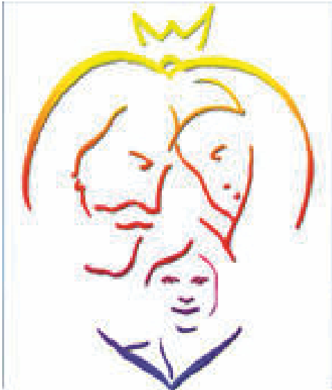
Holy Family Parish