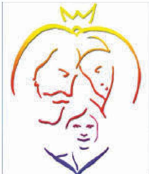
Holy Family Parish

Wed.(Sacred Heart, Spanish), Thur.(St. Ladislau, Hungarian)