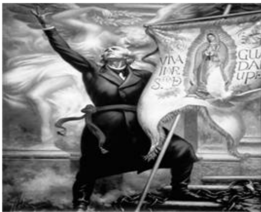
Rev. Miguel Hidalgo y Costilla Happy Mexican Independence Day! September 16th

19 th Annual Blue Mass for Law Enforcement Wednesday, September 29 – 10:30 a.m. Cathedral of St. Francis of Assisi, Metuchen