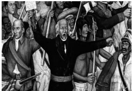
Rev. Miguel Hidlago y Costilla Féliz día de Independía de México 16 de septiembre

19a Misa Anual para Oficiales de la Ley Miércoles 29 de septiembre - 10:30 a.m. Catedral de San Francisco de Asís, Metuchen