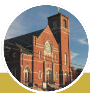
St. Mary 34 North Main Street Jewett City CT