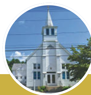
SS. Thomas and Anne 61 Preston City Rd Voluntown CT