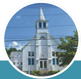
SS. Thomas and Anne 61 Preston City Rd Voluntown CT