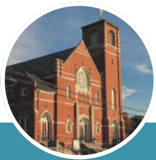
St. Mary 34 North Main Street Jewett City CT