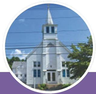
SS. Thomas and Anne 61 Preston City Rd Voluntown CT