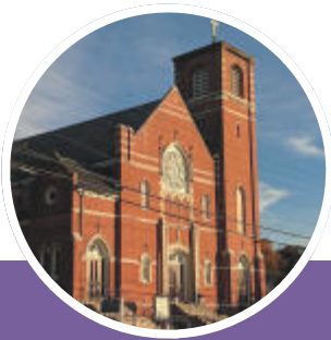
St. Mary 34 North Main Street Jewett City CT