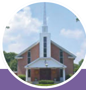
St. Catherine 243 Route 164 Preston CT