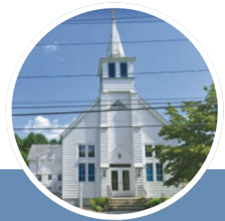
SS. Thomas and Anne 61 Preston City Rd Voluntown CT