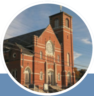
St. Mary 34 North Main Street Jewett City CT