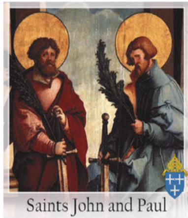
Saints John and Paul