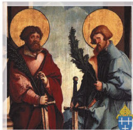
Saints John and Paul

O Holy Martyrs, Saints John and Paul, brothers by birth, and brothers in Christ, through your intercession, and under your protection, our parish has flourished in so many ways, and has grown to become the largest parish in the Diocese of Providence. Continue to watch over Ss. John and Paul Church and Fr. John V. Doyle School; Bless the families, clergy and religious of our parish, grant healing and comfort to the sick and sorrowful, bring back the lost sheep who have fallen away from the sacraments, bless and protect our youth, and answer the following petitions: (mention your intentions) . Obtain for us that same burning love for Christ and his Church, that led both of you to suffer martyrdom, rather than renounce your Catholic Faith.