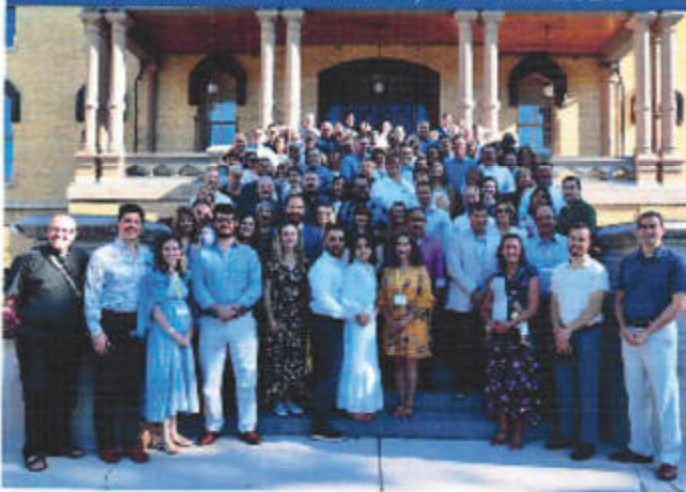
Missionaries to the Family Class of 2021