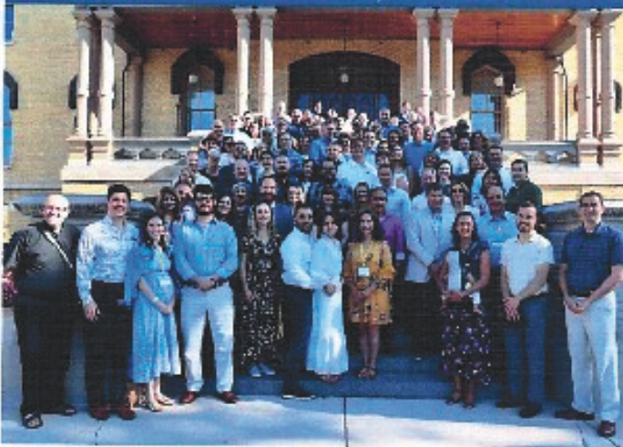
Missionaries to the Family Class of 2021