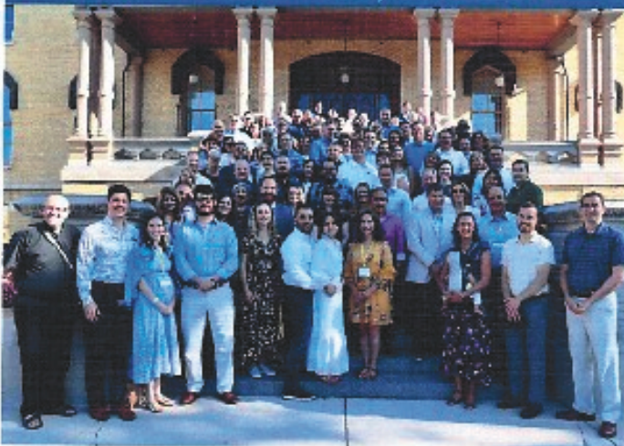
Missionaries to the Family Class of 2021