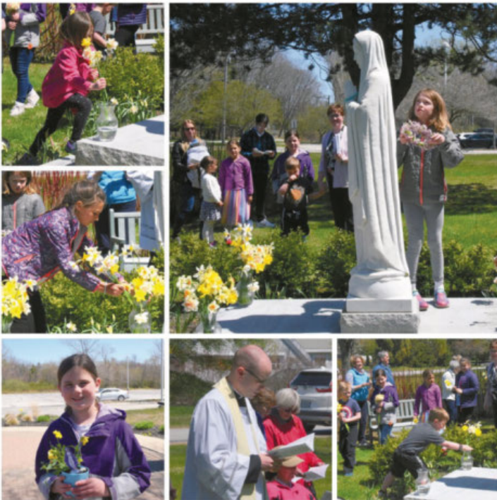
Thank you to everyone who joined us for the May Crowning on May 1 at St. Bartholomew. Our children did a lovely job honoring Mary.