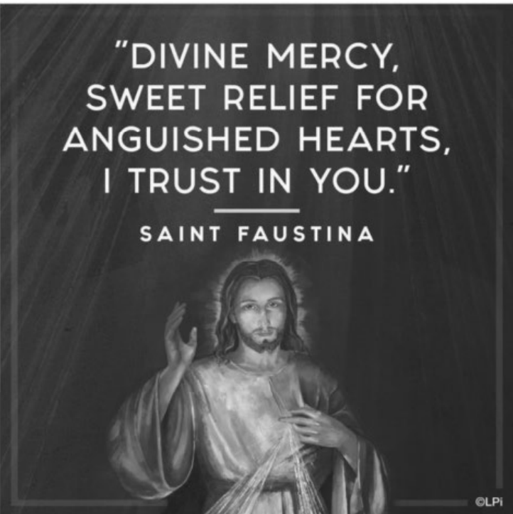
2nd SUNDAY OF EASTER

The apostle Thomas challenges his fellow apostles about the reality of Jesus' resurrection, seeking direct evidenced from Jesus himself. How often do you encounter fellow believers who are skeptical in their faith?