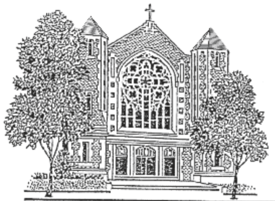
St. Andrew the Apostle Church 2 West 4 th Street, Bayonne, NJ Established 1914