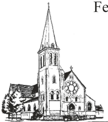
St. Mary, Star of the Sea Church 326 Avenue C, Bayonne, NJ Established 1861