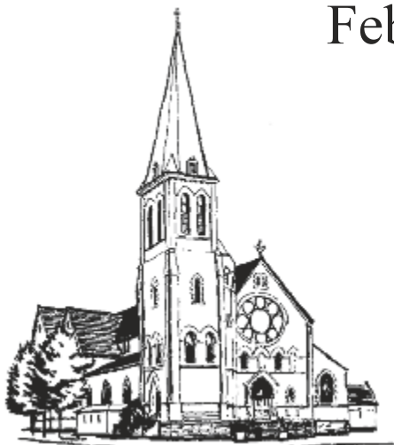
St. Mary, Star of the Sea Church 326 Avenue C, Bayonne, NJ Established 1861