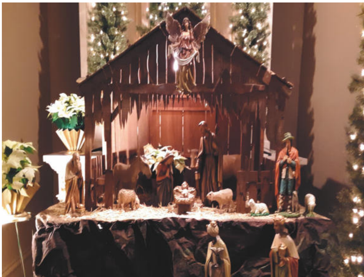
Nativity at Divine Redeemer Church

O Come! Let Us Adore Him CHRIST the Lord