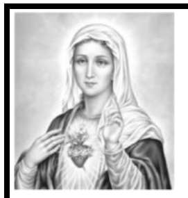
First Saturday Devotions