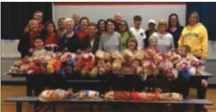
Volunteers preparing to serve after our prayer service. The multiplication of the loaves into 860 sandwiches!