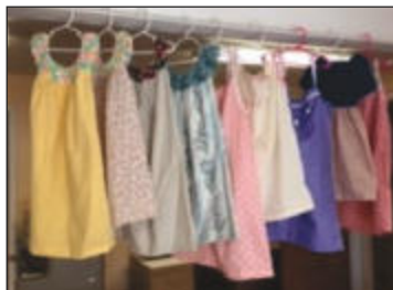
22 beautiful dresses that will allow little girls to attend school in Africa.