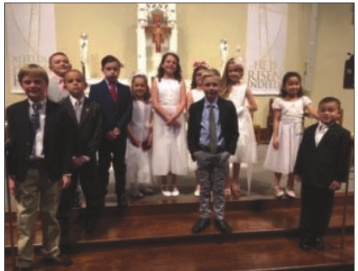
First Eucharist Celebration 5/19/19

Are you looking for a convenient, easy to remember way to be a good steward? Look into safe and secure Online Giving at Holy Spirit. You may access donation forms and manage your stewardship by using our parish website at: holyspiritchurcheg.org .