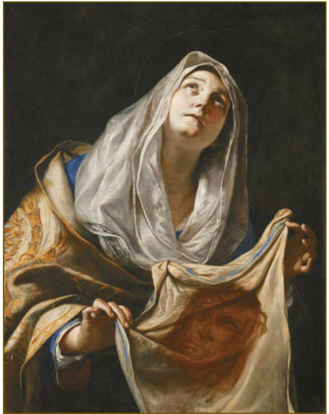
St. Veronica with the Holy Kerchief