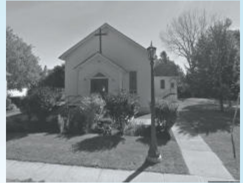
St. Andrew, Sackets Harbor